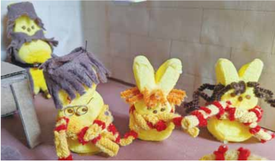
The Peeps are being sorted this week and will be ready to be placed in their own respective houses for residents to start work on their dioramas.