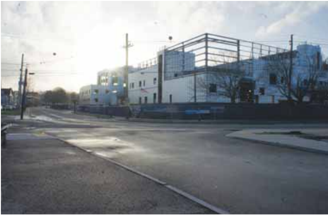
As the sun sets on Steward, MPT is taking over management of the construction at the rebuild site of the Norwood Hospital.