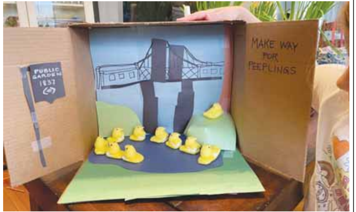
This year's theme is focused on local Norwood items, while the first year was aimed at recreating literary scenes, like this one recreating 'Make Way for Ducklings.'