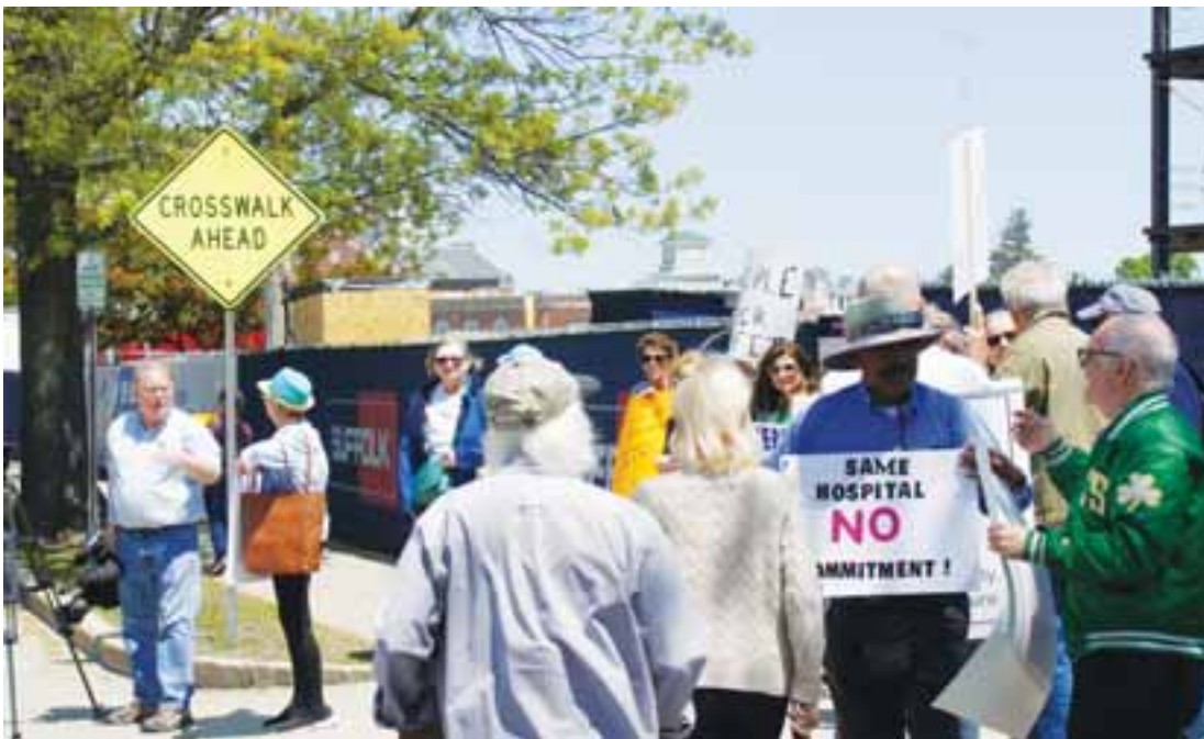
Residents and advocates picketed the site of the Norwood Hospital last week to protest the loss of psychiatric beds at the complex, currently under construction.