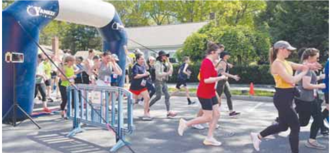
This year's Run for a Vet attracted hundreds of runners to raise funds and awareness of the myriad of issues veterans face today.