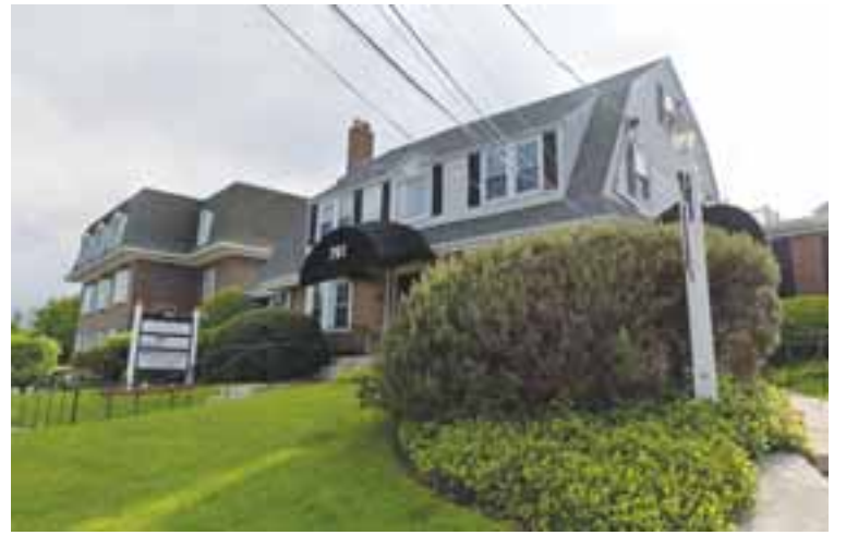
The dentist's office has had someone living above it for decades now.

“My client wants to make it a use that’s consistent with it being in a residential zone,” he said. “It’s been there all the time that he’s been there and the records I looked at that predate him coming to the site all indicate that there were people