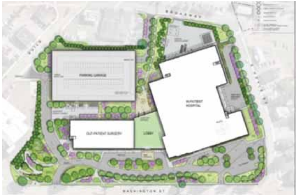
The layout design of the hospital presented by Steward.

This article is intended for information purposes only and does not represent legal or financial guidance. It presents the opinions and interpretations of the AMAC Foundation's staff, trained and accredited by the National Social Security Association (NSSA). NSSA and the AMAC Foundation and its staff are not affiliated with or endorsed by the Social Security Administration or any other governmental entity. To submit a question, visit our website ( amacfoundation.org/programs/social-security-advisory ) or email us at ssadvisor@amacfoundation.org .