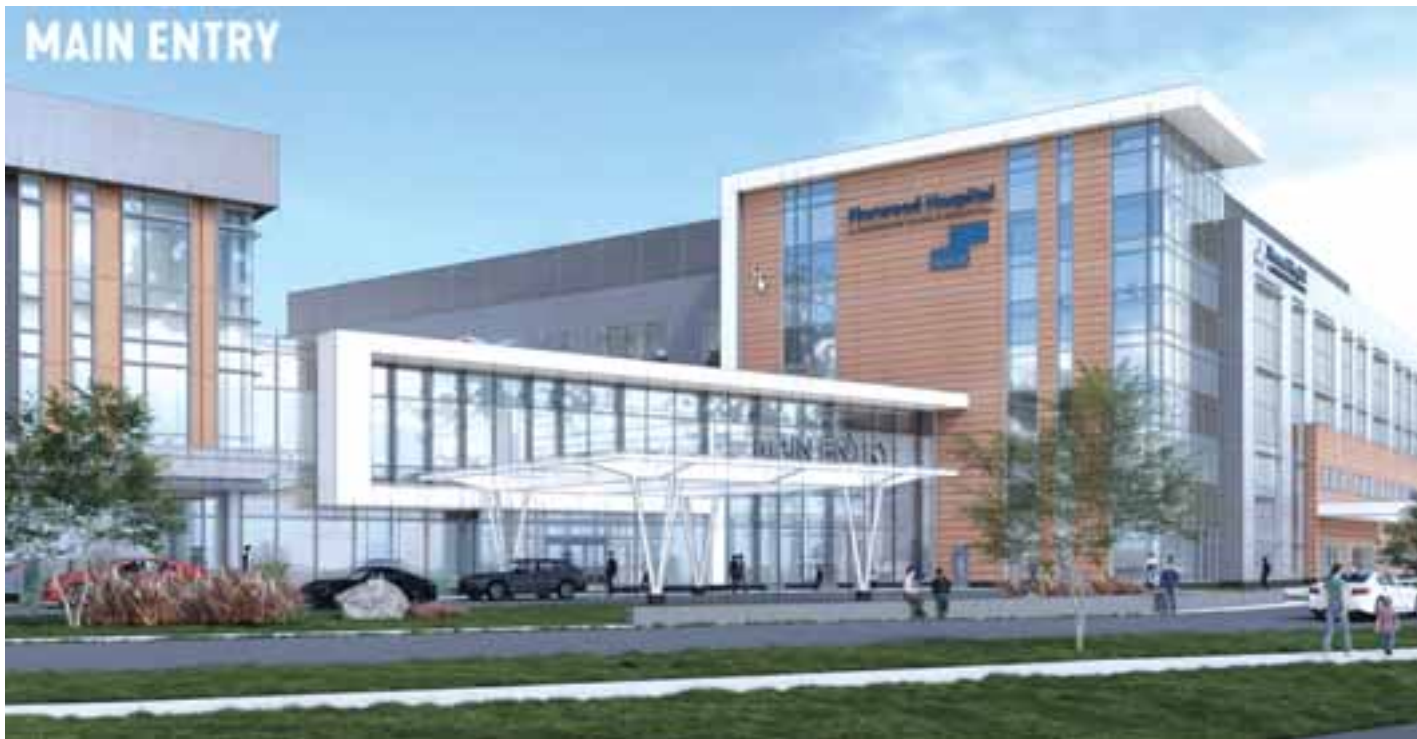
Several residents are still not satisfied with the lack of psychiatric beds at the new Norwood Hospital, a rendering of which is shown above.