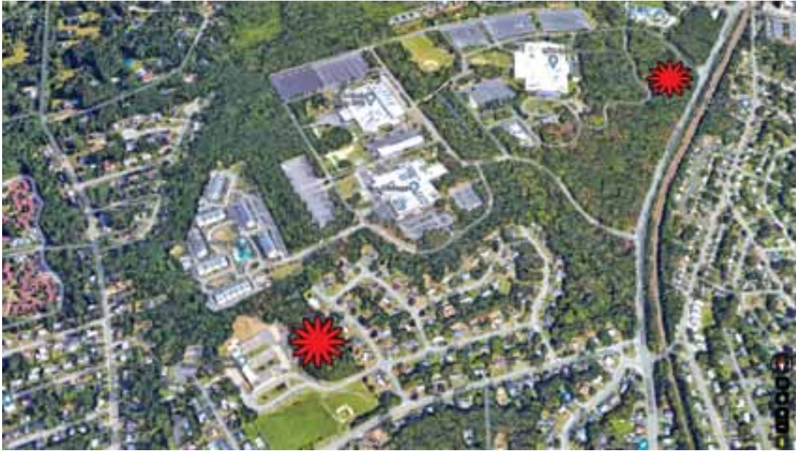
The Norwood Trails Advisory Committee is pondering putting a trail between these two points near the Forbes Hill Mansion and Moderna Campus site.