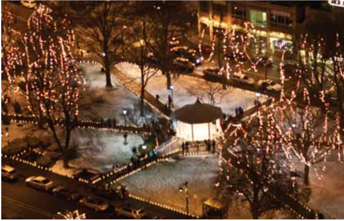
The Circle of Hope is once again looking to light up the Norwood Town Common with thousands of memories of those who came before.