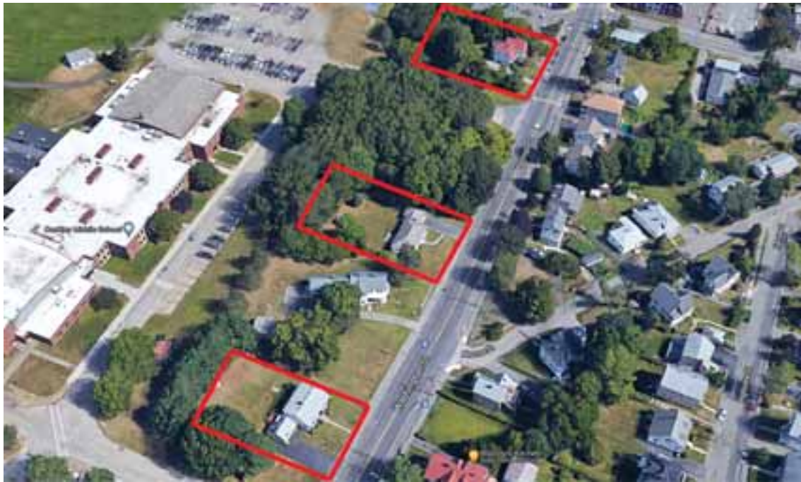
The Town is looking to buy and demolish these three properties on Washington Street over by the Coakley Middle School, shown on the left.