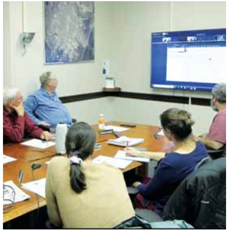
The Norwood Conservation Commission approved a catch basin at the Big Y location last week.