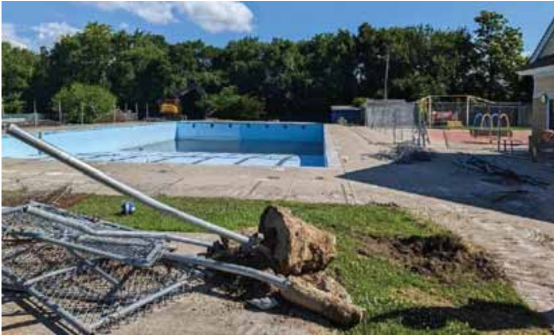
Construction is now underway at the Hawes Pool for a complete replacement of the pool itself, the splash pad and other amenities. The pool is expected to be closed throughout the summer season this year, with programming moving to the Father Mac's Pool at 295 Vernon St. near the Highland Cemetery. Day passes can only be purchased at the pool with a credit or debit card. For more information on pricing and availability, go to https://tinyurl.com/3eebatx6