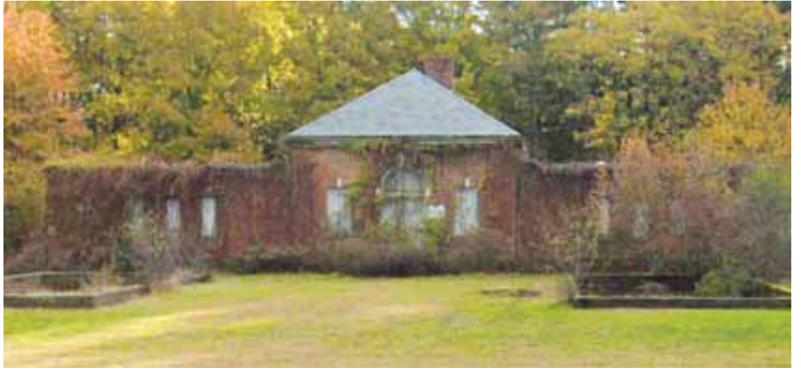
The Norwood Historical Commission is looking to pump you up, and develop interest in Town around figuring out how to put the old Norwood Pumping Station to public use.