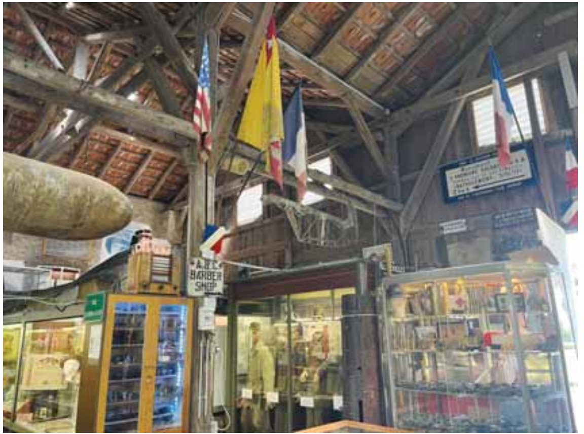
The museum features an excess of artifacts from both World Wars in an old, unassuming converted barn in eastern France.

This article is intended for information purposes only and does not represent legal or financial guidance. It presents the opinions and interpretations of the AMAC Foundation's staff, trained and accredited by the National Social Security Association (NSSA). NSSA and the AMAC Foundation and its staff are not affiliated with or endorsed by the Social Security Administration or any other governmental entity. To submit a question, visit our website ( amacfoundation.org/programs/social-security-advisory ) or email us at ssadviser@amacfoundation.org .