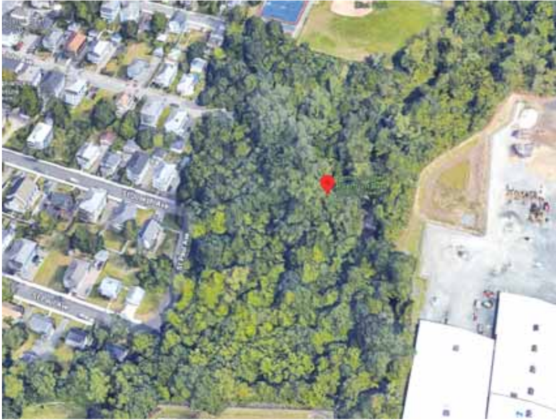
Construction has started at the Bernie Cooper Memorial Riverfront Park in South Norwood.