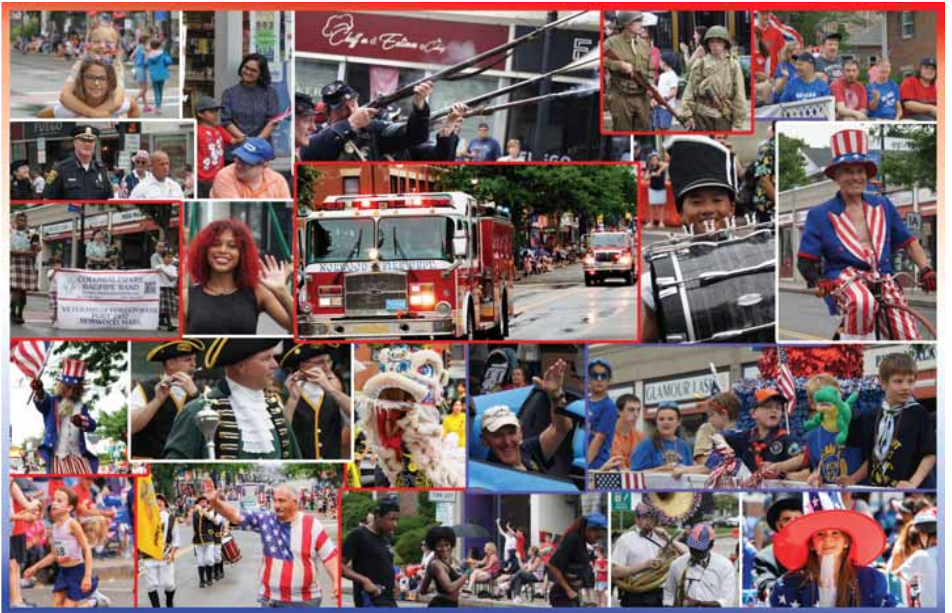
Despite a little rain here and there, more than a thousand residents came out last week to celebrate the birth of the United States in Norwood.