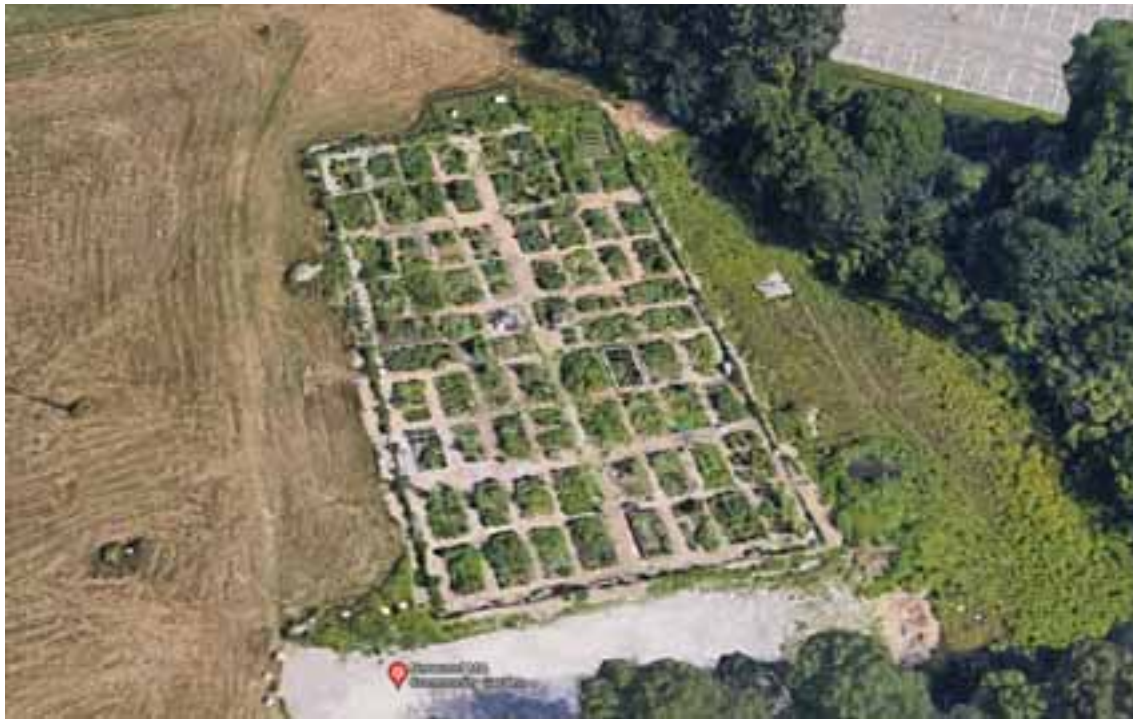
The Norwood Conservation Commission discussed a proposal from the Norwood Community Garden to add plots amid high demand.