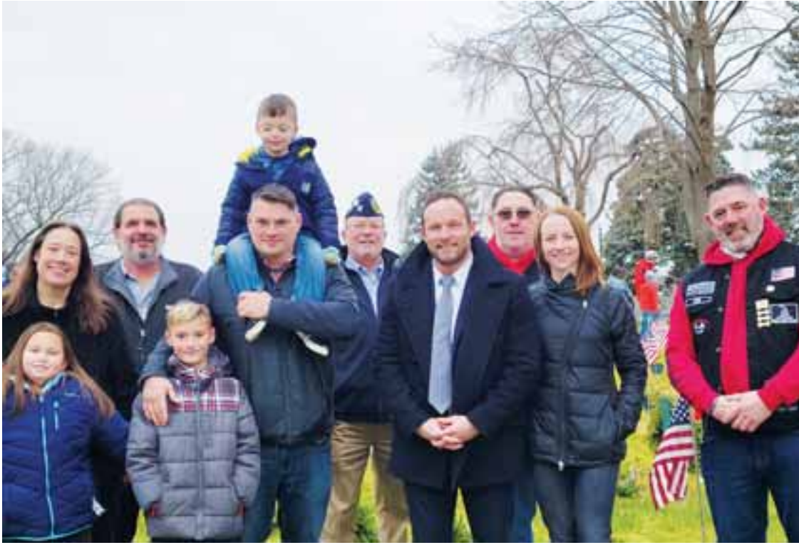
Wreaths Across America will be hosting a ceremony at Highland Cemetery this weekend.