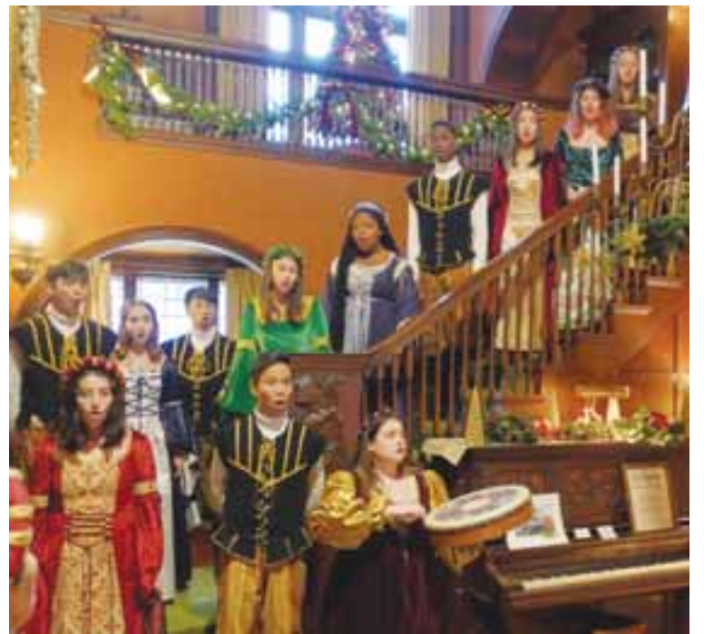
The Madrigals set up shop on the staircase in the Day House.