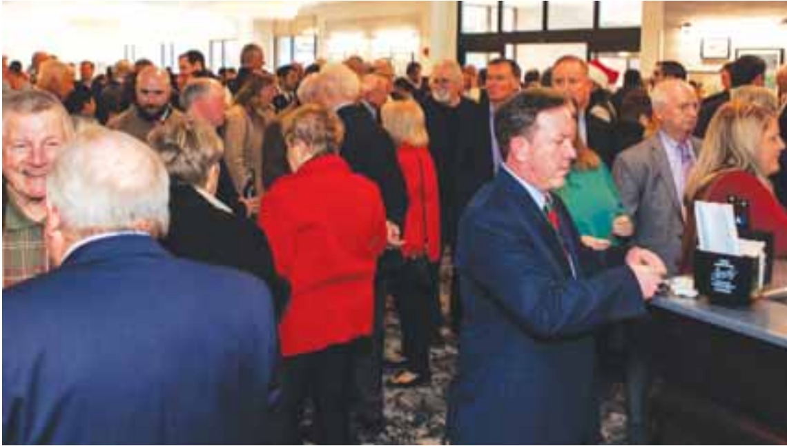
Hundreds came out to the 2022 Friends of St. Nick last week at the Four Points Sheraton Hotel on Route 1.