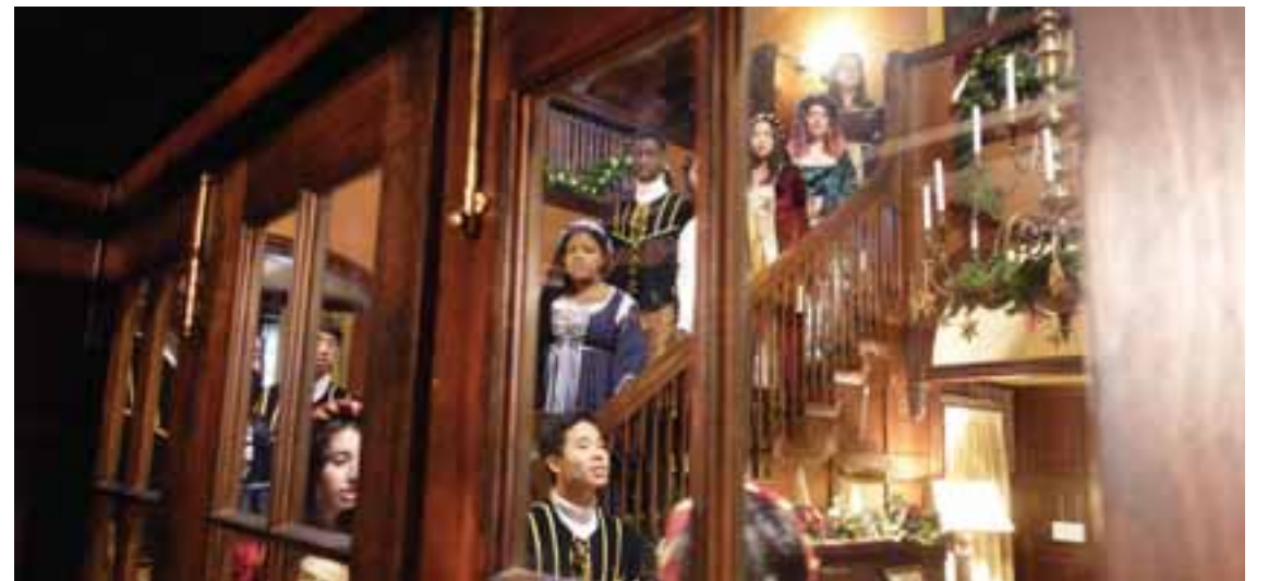
The singing group will have one more Christmas concert this year at the Norwood High School.