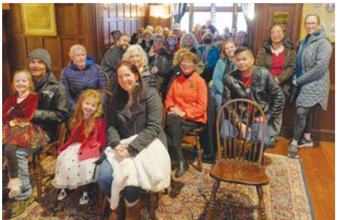
Residents crammed into the Day House and hoped to get a seat near the heater for the performance.