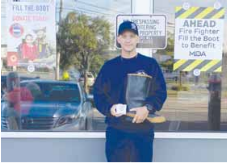
It's that time again to get your change and help the Norwood Firefighters Fill the Boot for the MDA.