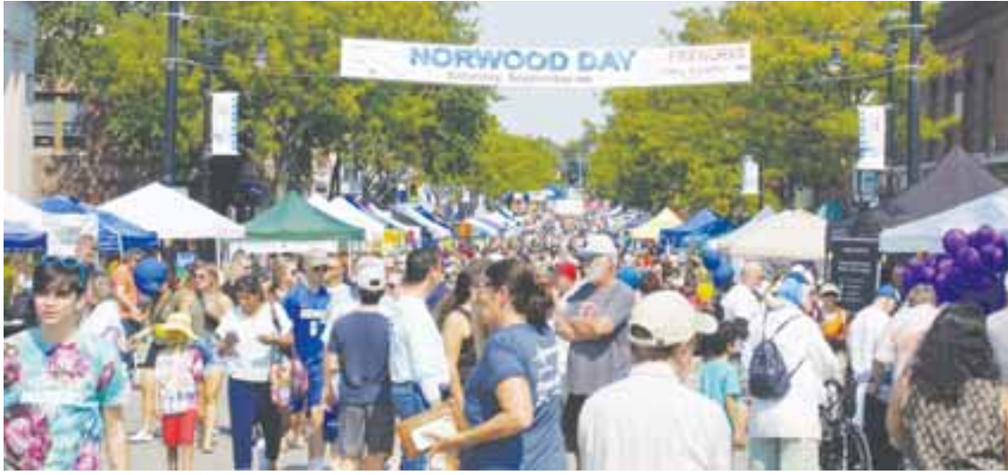
Thousands lined the streets during the day, taking in fried dough, free gifts and a lot of information from Town boards and organizations.