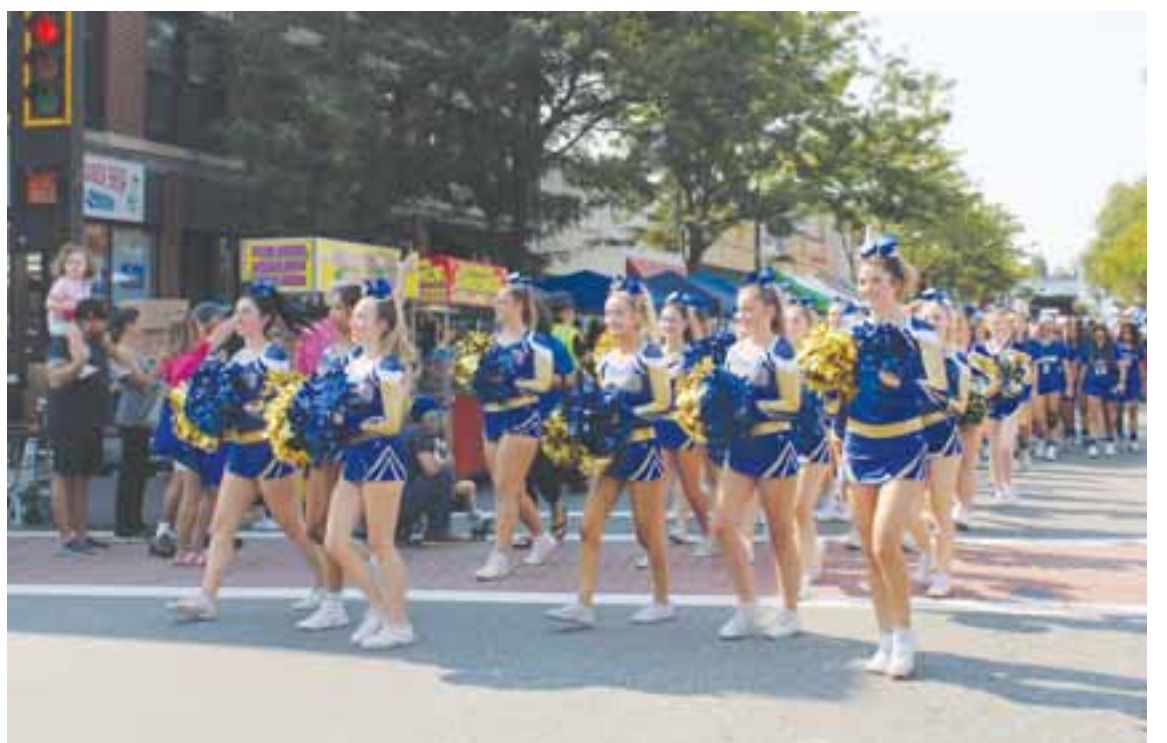
Thousands came out on Norwood Day this year, with many feeling that this was the most attended in years.