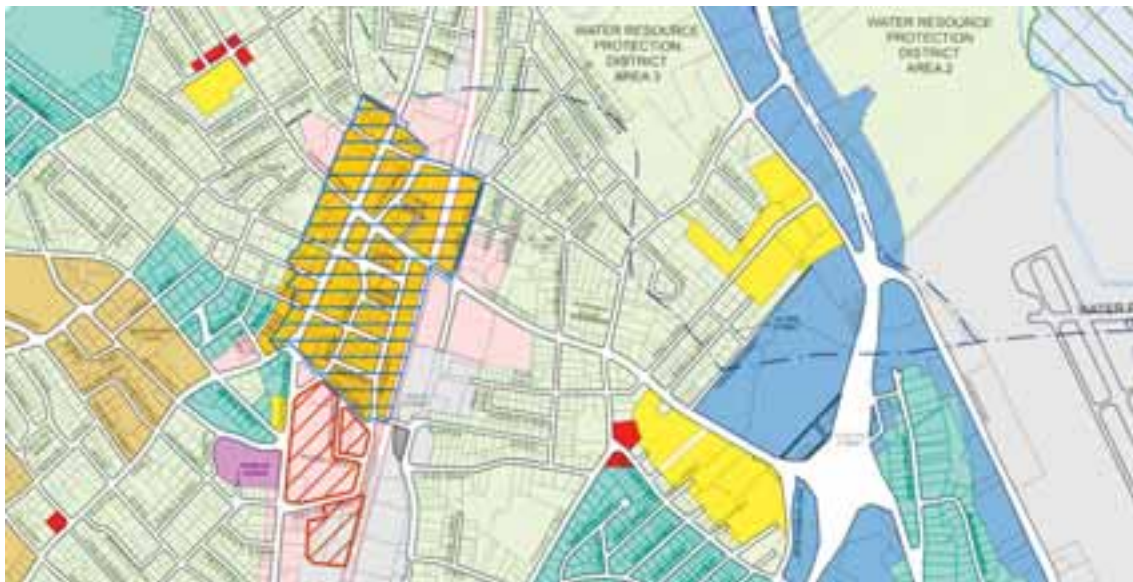
The 3A MBTA Communities Task Force looked at areas currently zoned for multi-family use with a special permit, shown here in yellow, as a way to comply with the 3A regulations.