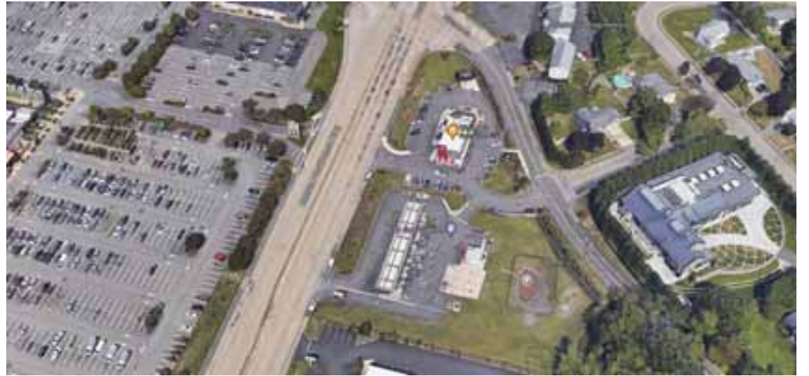
The drainage structure at the site, towards the southeast of the complex, has been a problem since it was installed years ago.