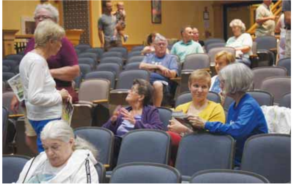
Many residents agreed that something must be done for stormwater control in the Town, just not necessarily on what precisely that something is.

"Cross Street has only flooded once," Mackiewicz added. "And it might be that