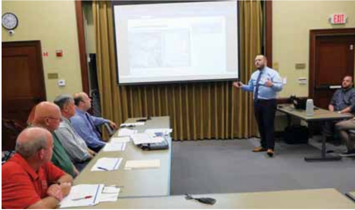
The Capital Outlay Committee discussed several projects for the Town and whether or not the Town needs them.