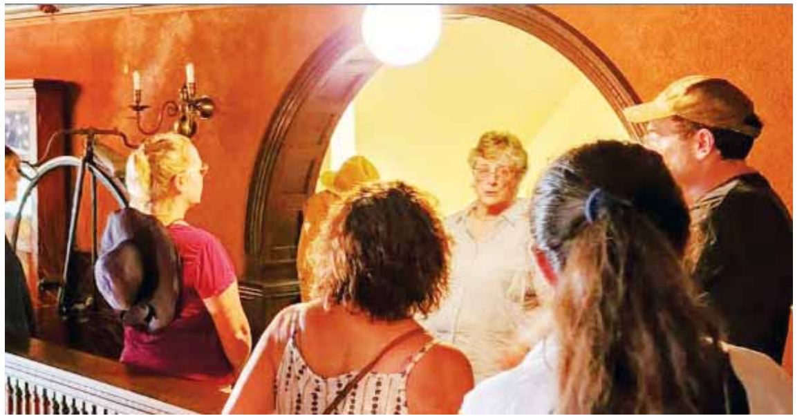
Residents were treated to tours of the Day House, which has been in the Norwood Historical Society's keeping since the 1930s.