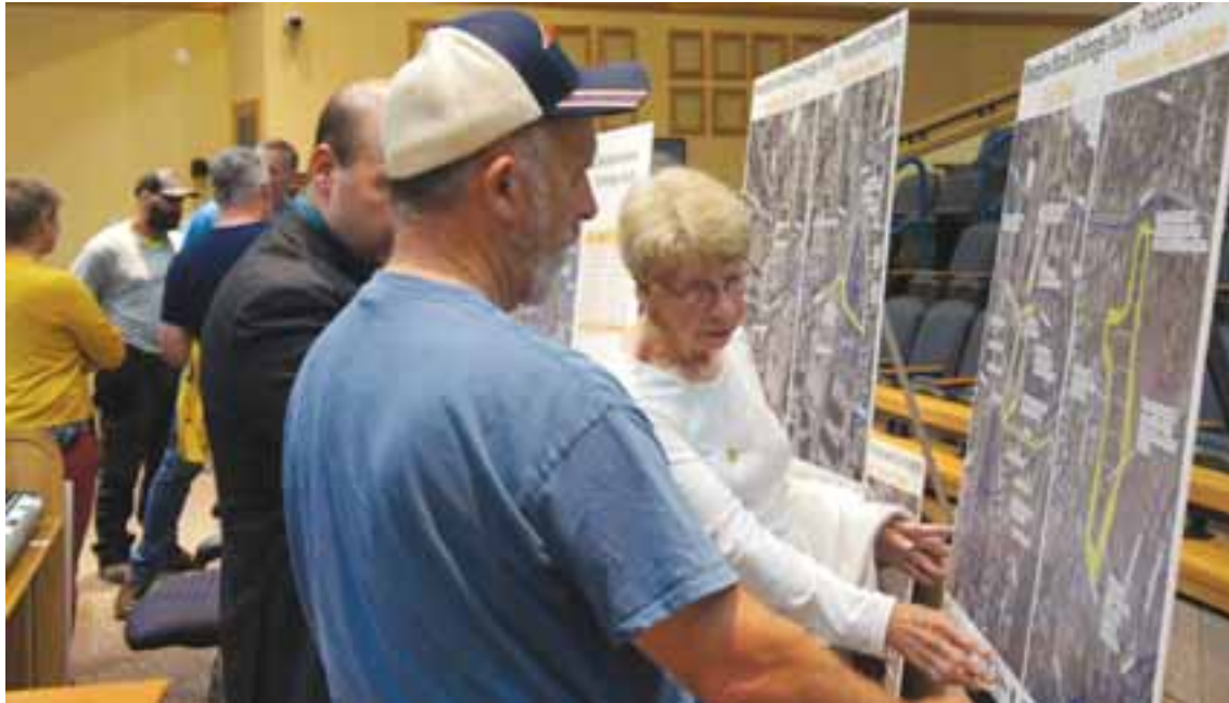
About 50 residents came to last week's Stormwater meeting and expressed concerns around the plan to turn part of Hennessey Field into a detention basin/man-made wetland.