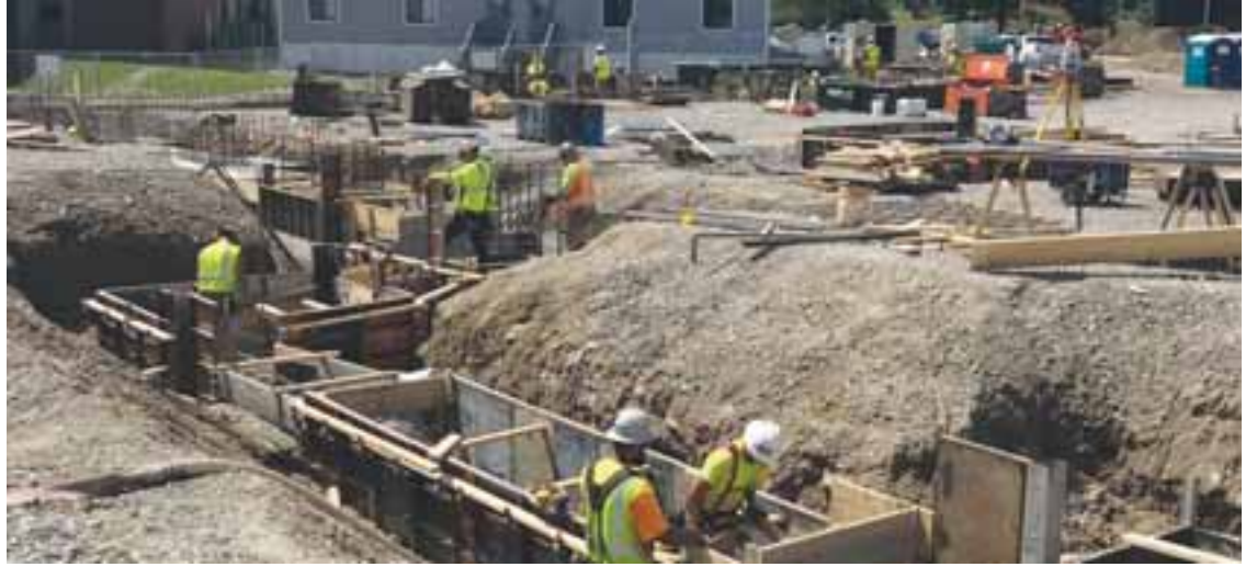
Construction continues at the Coakley Middle School, which could see a name change in the coming weeks, or, it could have residents confirm its current moniker.