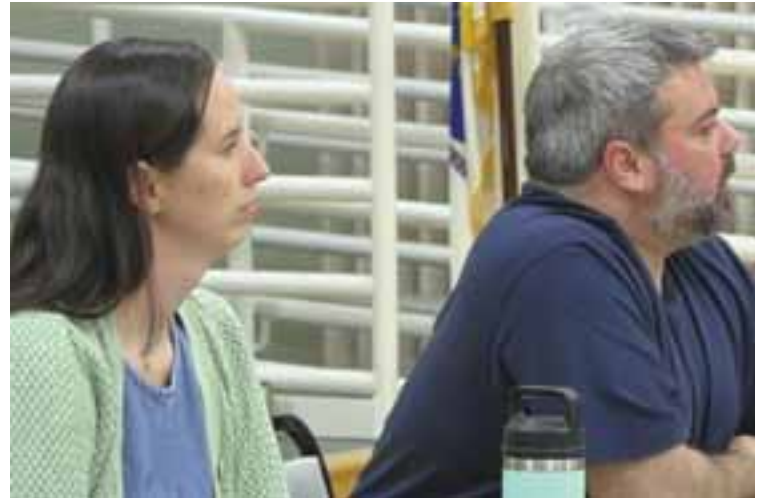
The Wendy's/BJ's drainage is still a problem more than five years later, and the ConCom is trying to make sure it's fixed.