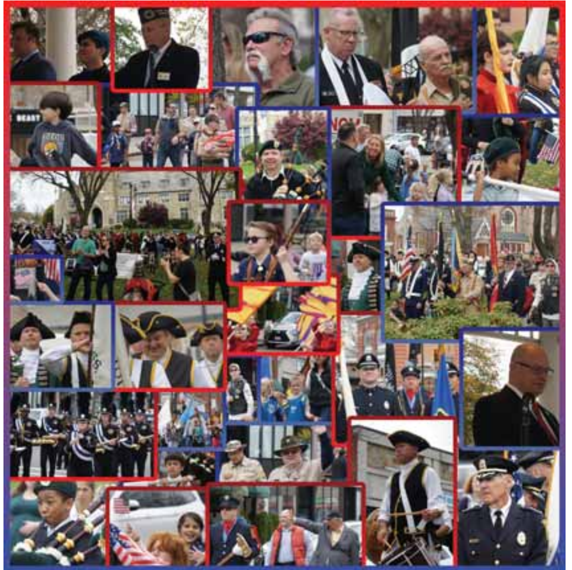
Hundreds came out for this year's Veterans Day Parade on the Norwood Common, including at least one helicopter pilot.