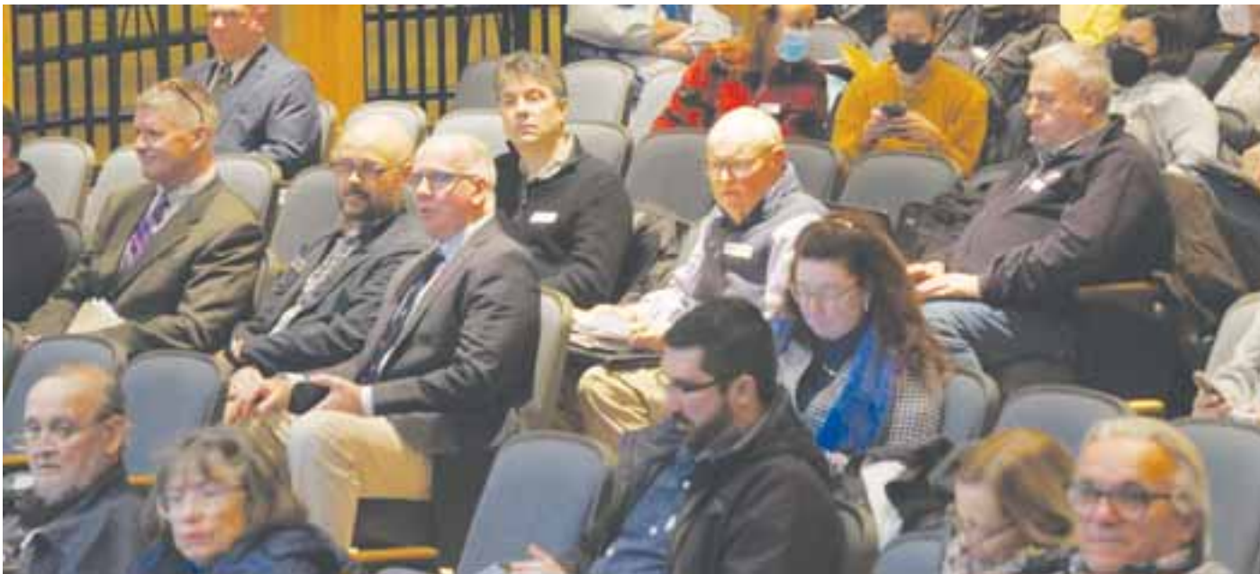
Norwood Town Meeting ended in one night on Monday, possibly because one of the big ticket items, 259 Lenox, was taken off the agenda in the first half hour of the meeting.