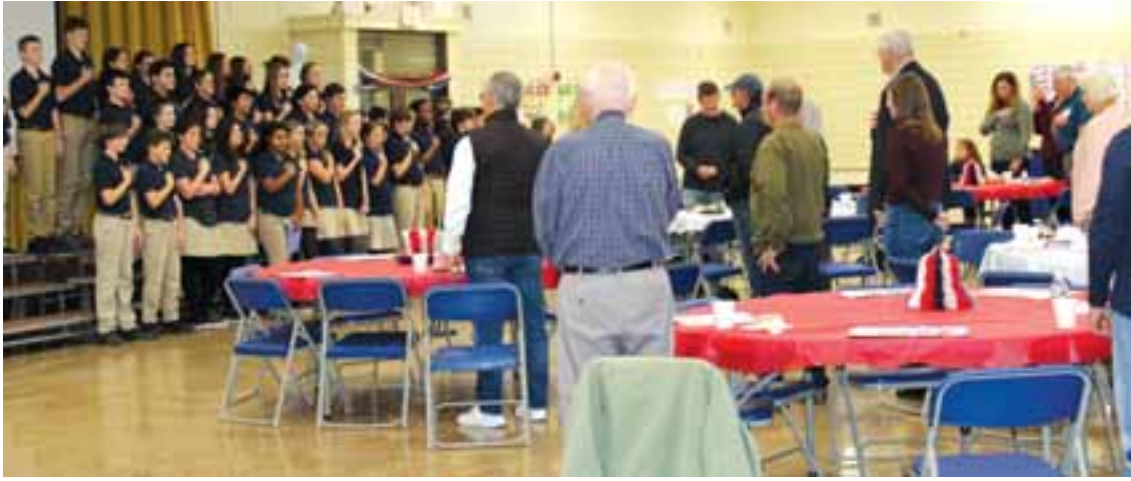
St. Catherine's School held a veterans event the day before Veterans Day. Here, vets, student and faculty stand for the U.S. Pledge of Allegiance.