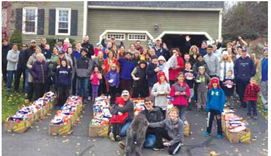
Neighbors, friends and family all pitched in over the past 35 years to make the annual food collection a well-oiled machine.