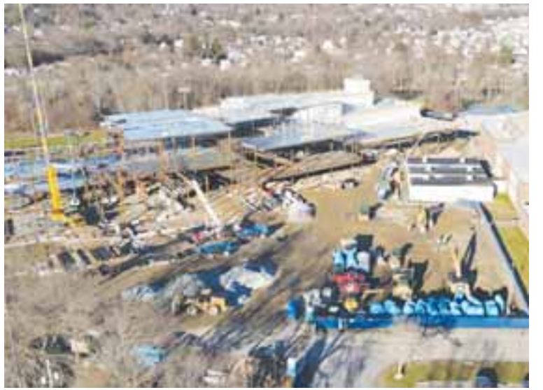
An aerial view of the construction site at the Norwood Coakley Middle School.