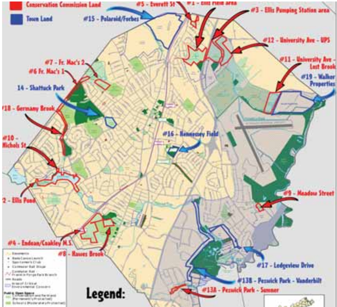
The overall plan for the Norwood Trails system is to connect as many of the current trails as possible into one connected network.