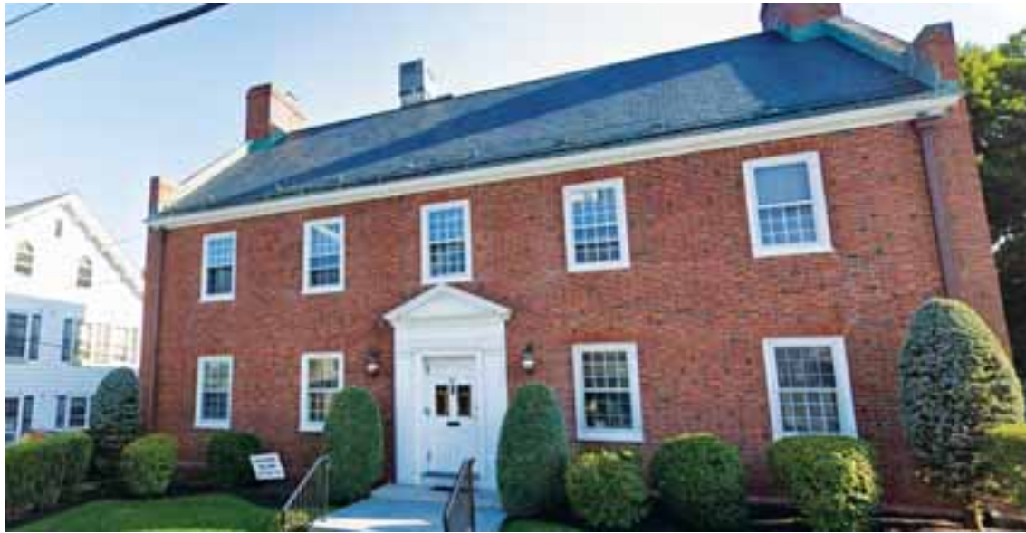
The CPC heard a presentation concerning a proposal for 20 units of veteran housing at this building on Vernon Street.