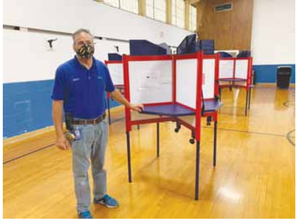
Norwood is getting ready for its upcoming April 5 Municipal Election, for which in-person voting and absentee voting options will be available.