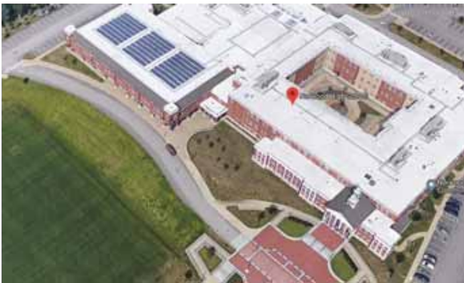
The School Committee finalized a plan to change school start times at the beginning of the 2022 school year.