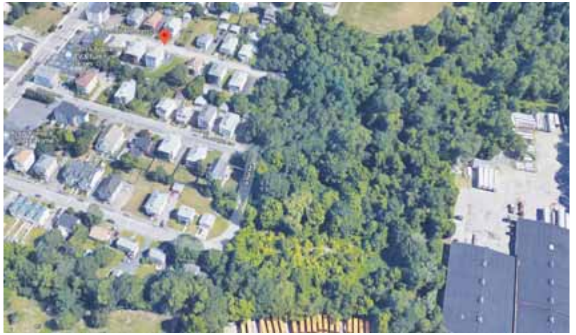
The plan to turn the area into a park has not been halted due to the recent discovery of asphalt under the current topsoil.