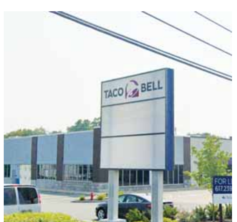
An appeal of the Building Inspector's initial decision did not go through for an urgent care at this site on Route 1.