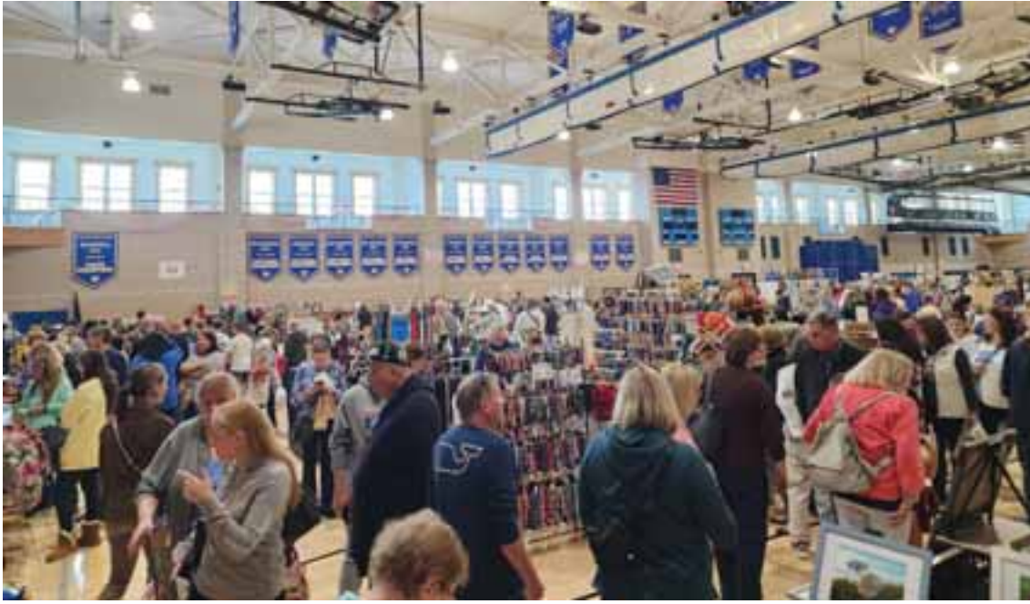
More than 1,800 patrons came out to peruse the many vendors at the Norwood Craft Affair this Saturday.