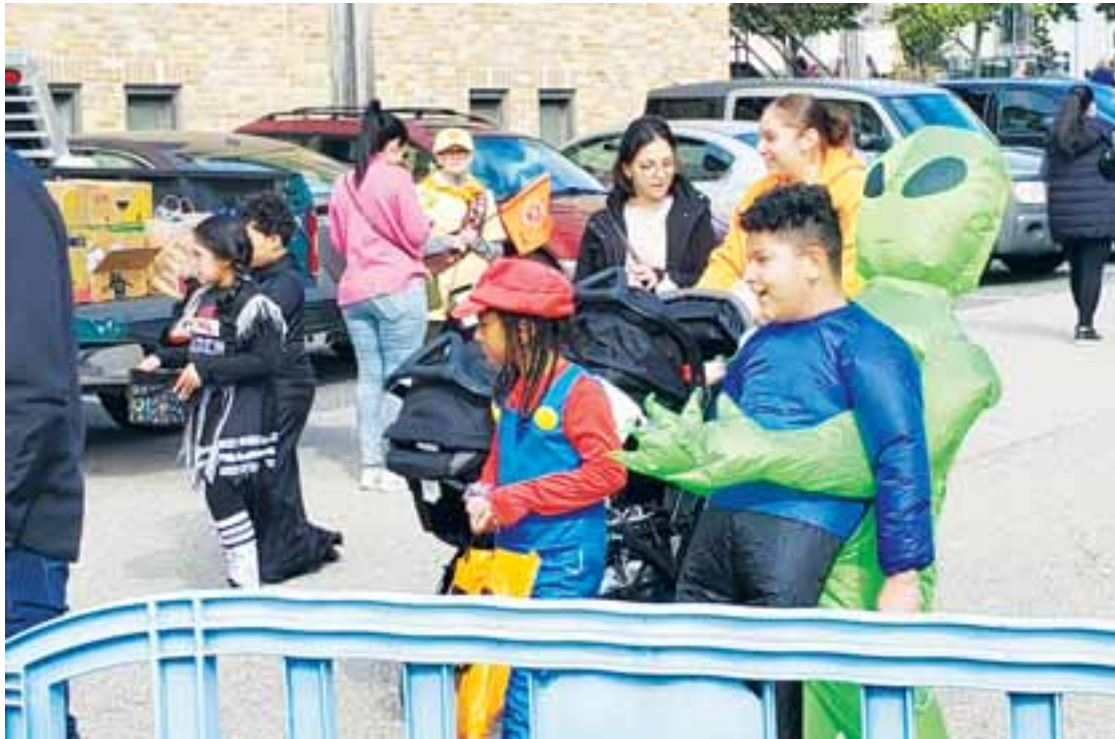
Hundreds came out dressed to impress at this year's Trunk or Treat at the Norwood Department of Public Works in Town..