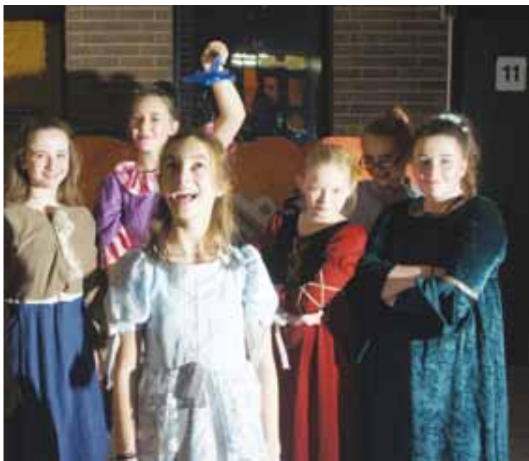
The night will feature fairy tales performed by students for young children.

sible, and strollers are welcome," she said. "One of the reasons we moved it from the Savage Center down the street is that there are stairs there. There is a lift at NHS so when you're bringing little children and they still need to be in a carriage, people can lift their strollers. This makes it easier. It's also better for grandparents."