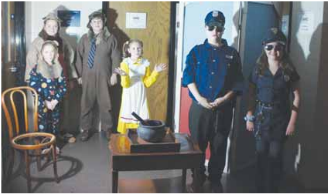
Goldilocks and the Three Bears didn't originally have police in the story, but Fantasy Footsteps has in the past made such edits to make the stories more children-friendly.