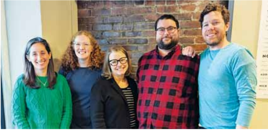
Current members of Norwood for All, a housing advocacy group that Abundant Housing Massachusetts recently awarded the 'Rookie of the Year' title.