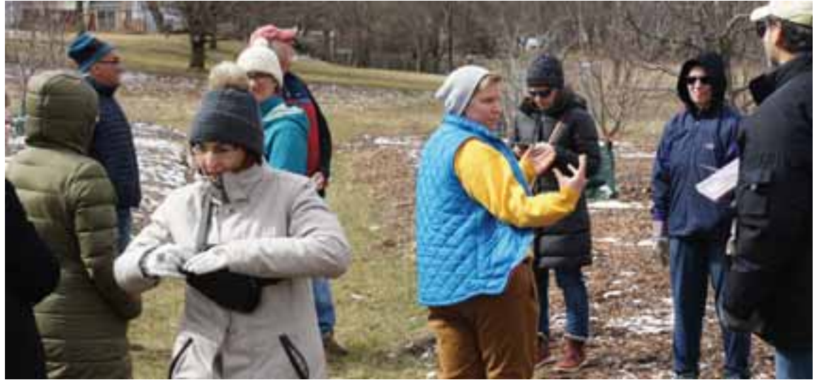
About 15 residents came out to learn how to properly take care of the trees and shrubs at the Norwood Community Orchard.

If you’d like more information on the Community Orchard at 20 Mylod St., reach out to the Norwood Conservation Commission by heading over to https://bit.ly/3YkVsFG