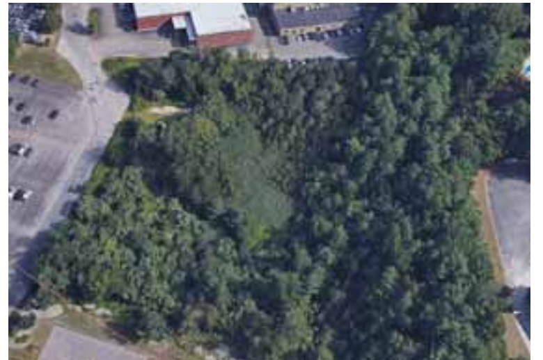
This bit of groundwater wetlands may be new, but the ConCom said it is still wetlands.