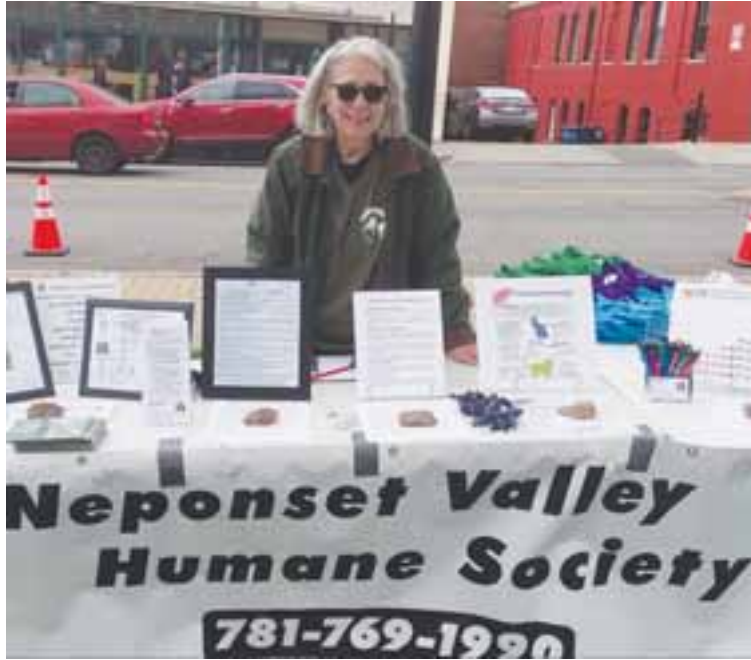
The NVHS raises funds to foster and adopt lost pets throughout the local area; Norwood and beyond.

Tainter said they would be promoting all donors in all their outreach materials.