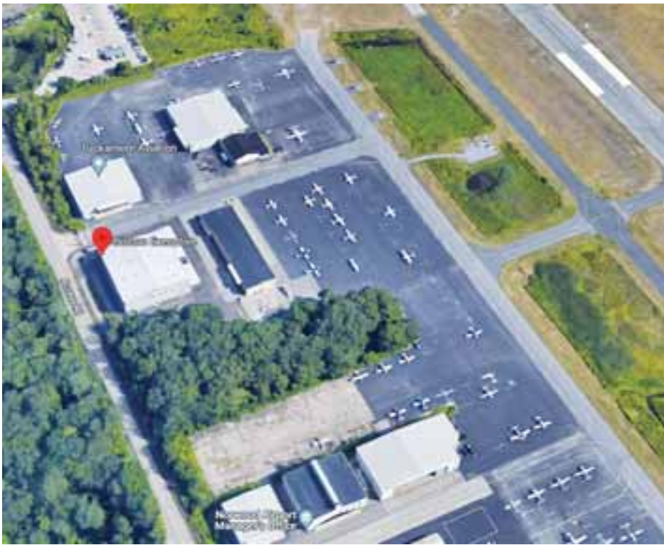
Boston Executive Helicopters, located at the Norwood Airport, saw a favorable ruling recently at the U.S. Court of Appeals.