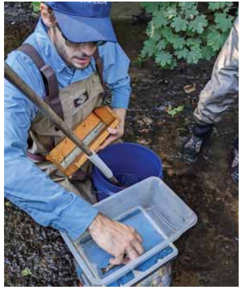
Young fish are a good sign, as it shows the intent of the dam removal is working. In this case, it's working much faster than expected.