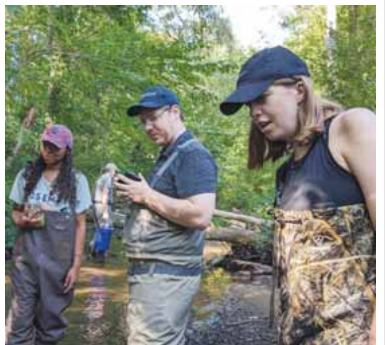
Even though the dam at Traphole Brook was just recently opened up, surveys have found newly-spawned trout in the waterway, which the Conservation Commission said is a really good sign.