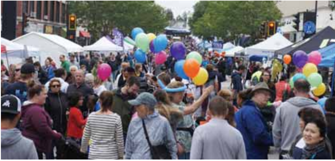
More crowds are expected for this year's Norwood Day, despite the fact that last year's celebration attracted way more patrons than was expected.