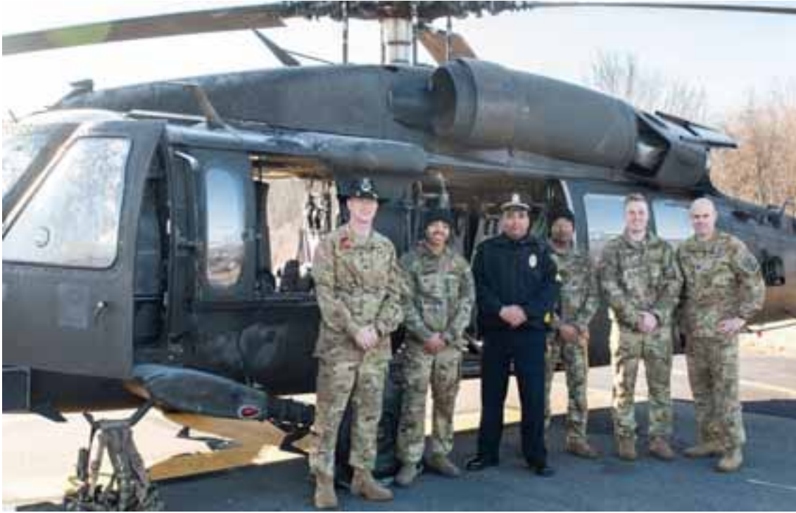
The NAC also discussed preparations that took place in November for the Army Navy game at Patriot Place in Foxboro.