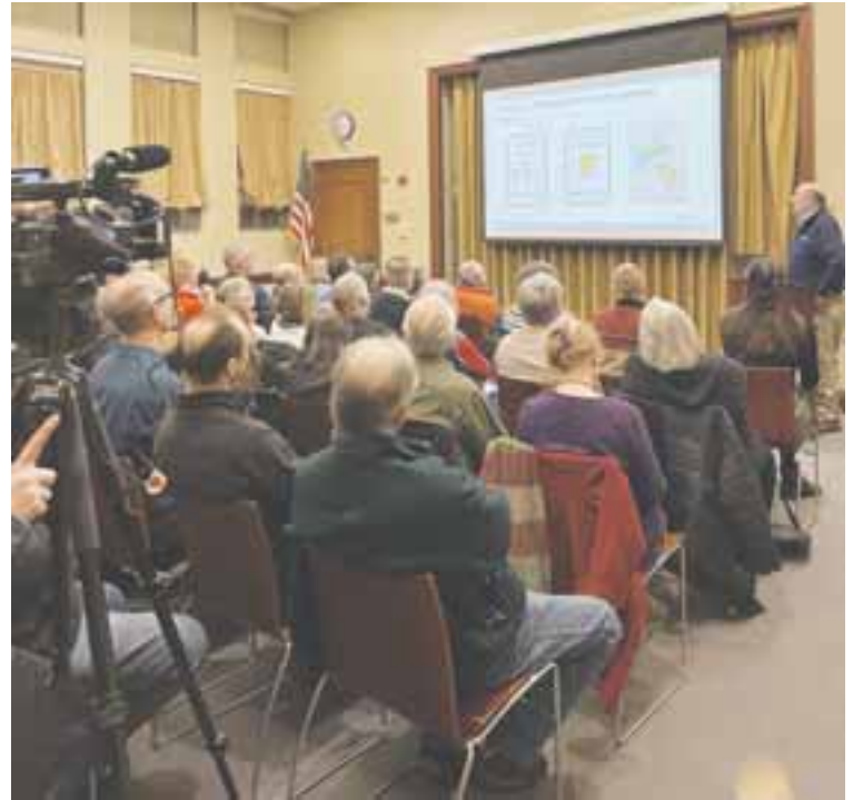
Norwood officials and NepRWA employees detailed the issues around stormwater in Town.