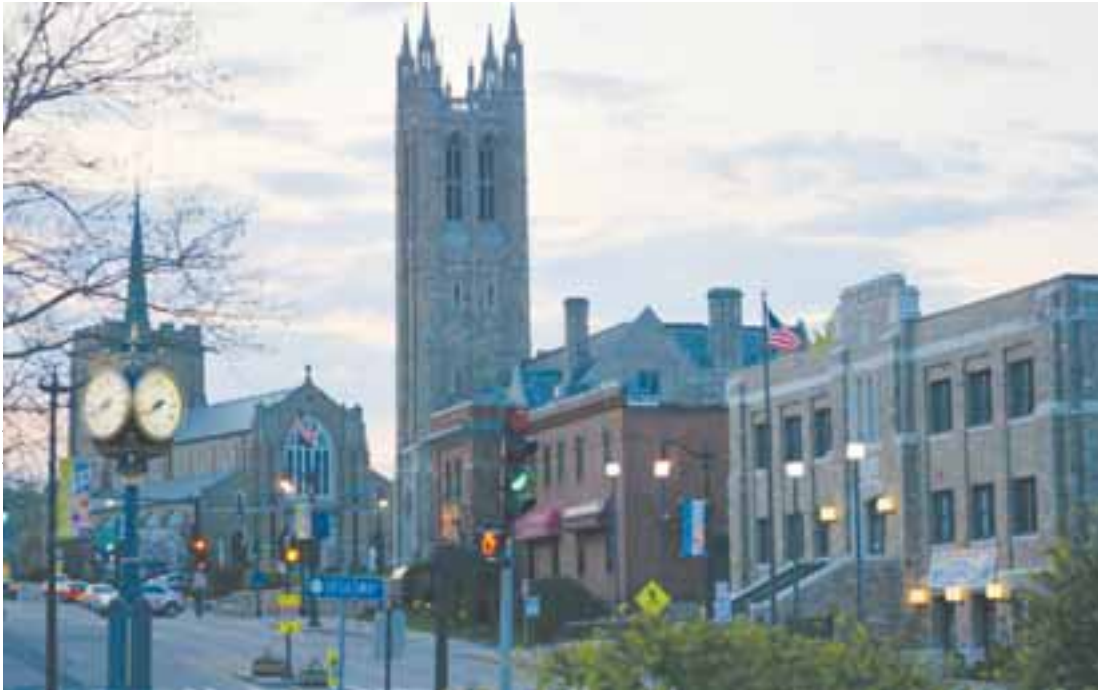
Upcoming projects include renovations to the Town Hall and repairs to the facade of the Civic Center.