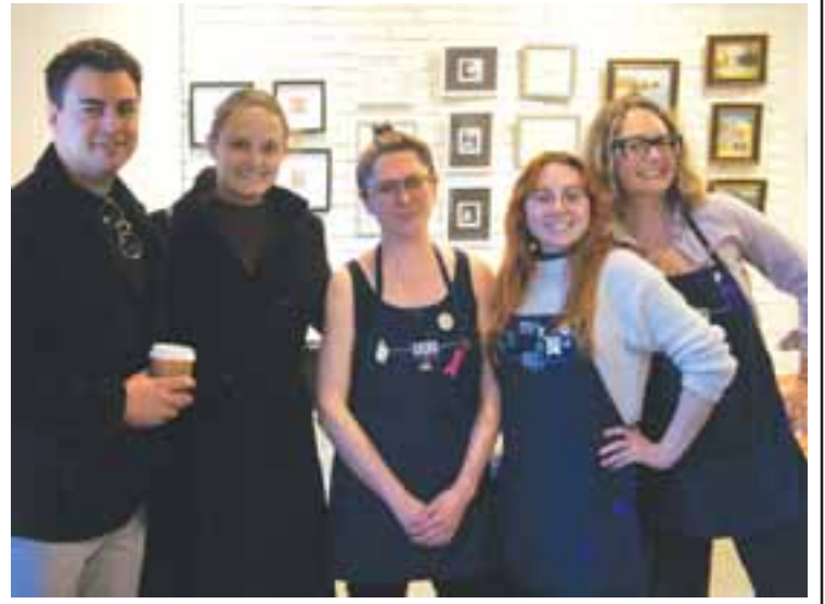
Tax Solutions, Modern Eyes and Custom Art Framing all hosted dozens of pieces for this month's Art Hop. Custom Art Framing employees and visitors shown above.