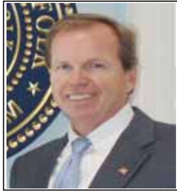
Register of Deeds

9.) What's the one present the little girl in the movie wished for that would make