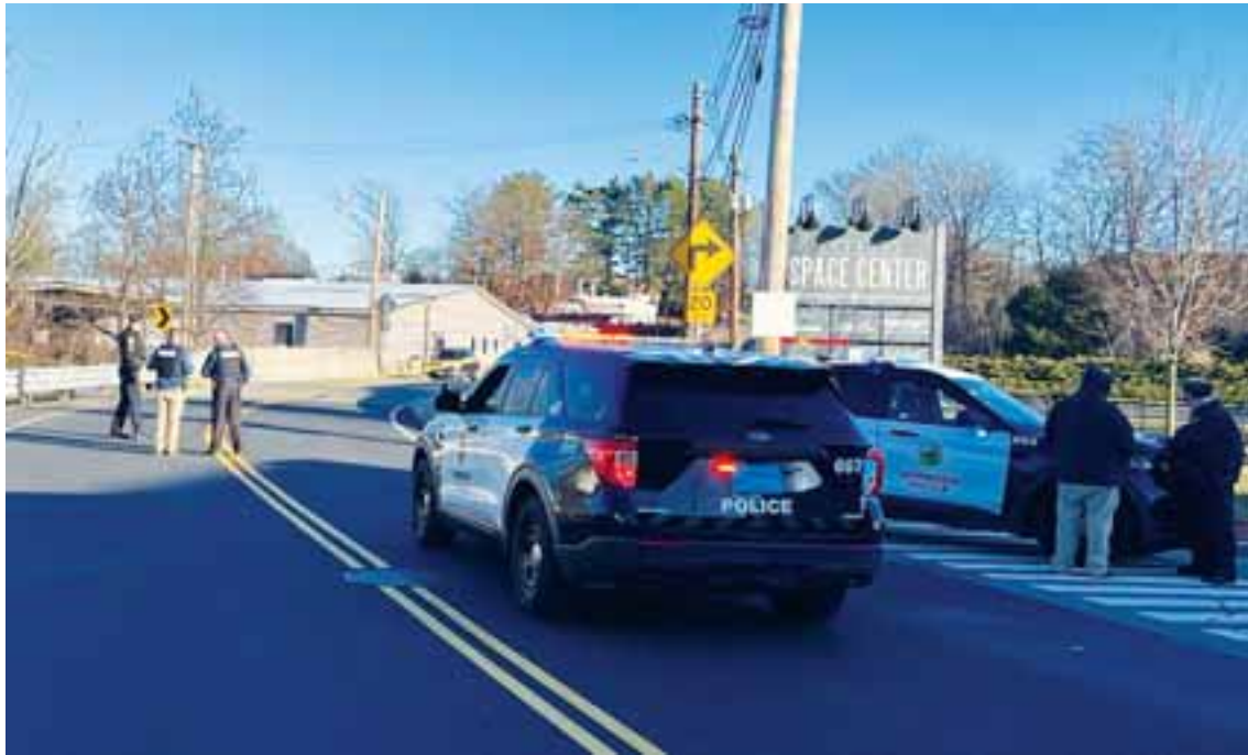
The Norwood Police Department reported last week an officer-involved shooting that took place around Morse Street in Norwood after an approximate 40-minute confrontation.