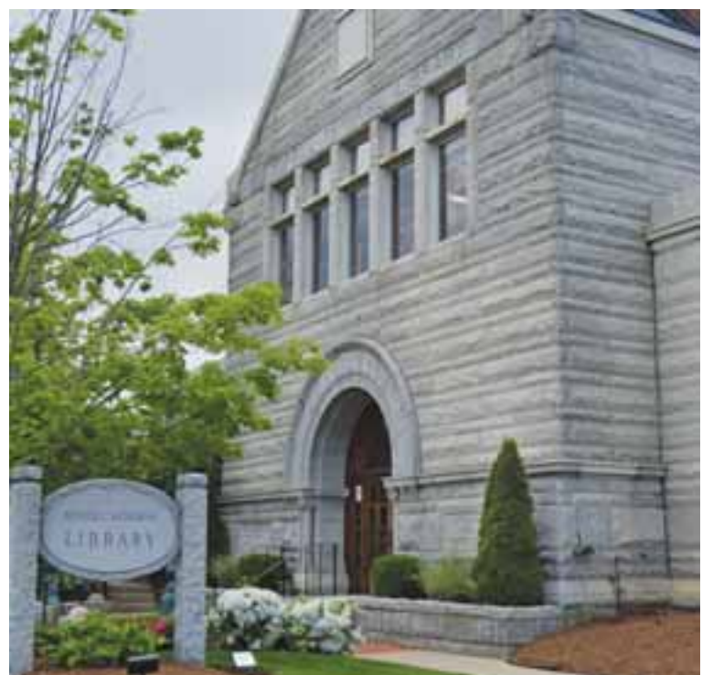
The Library Board is lauding the accomplishments of the Morrill Memorial Library's language program.

Library Language Program Continued on page 2