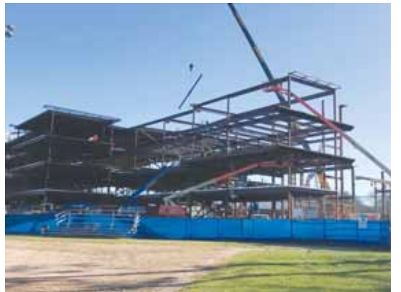
The new Coakley Middle School Project recently had its topping off ceremony.