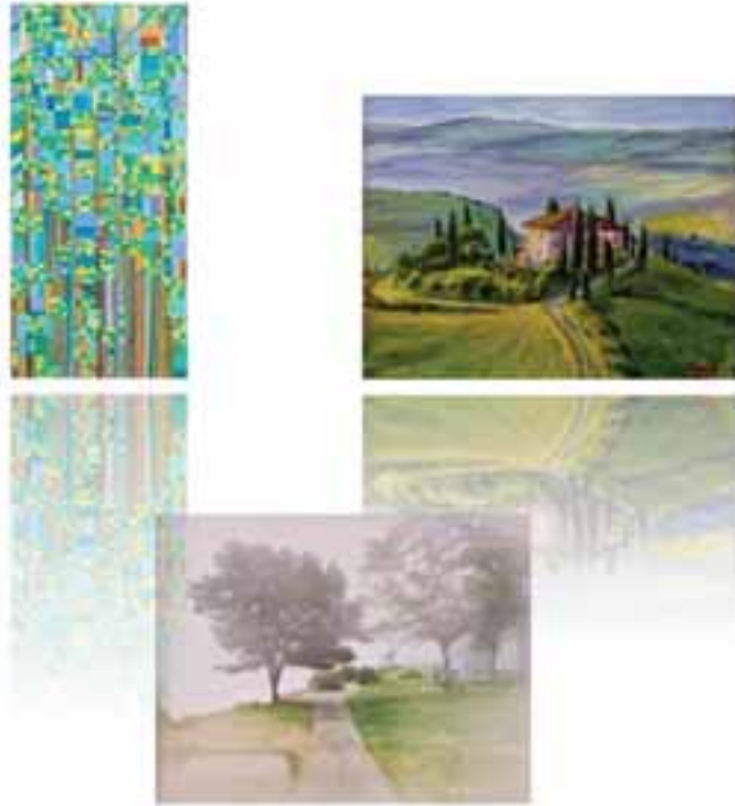
The Norwood Art Hop is coming to Town this Friday.