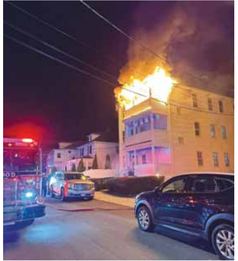
The Norwood Fire Department reported responding to a call at St. Joseph Avenue on Nov. 23 and found the fire so severe a second alarm was called.

"Two of the families are currently being housed at a hotel in Town," he said. "Internally, there