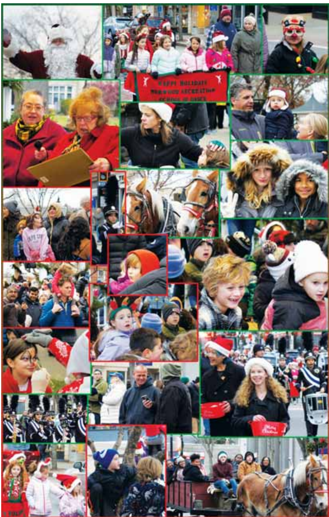
Town officials reported more than a thousand residents layering up and heading out to this year's Norwood Holiday Extravaganza on Sunday.