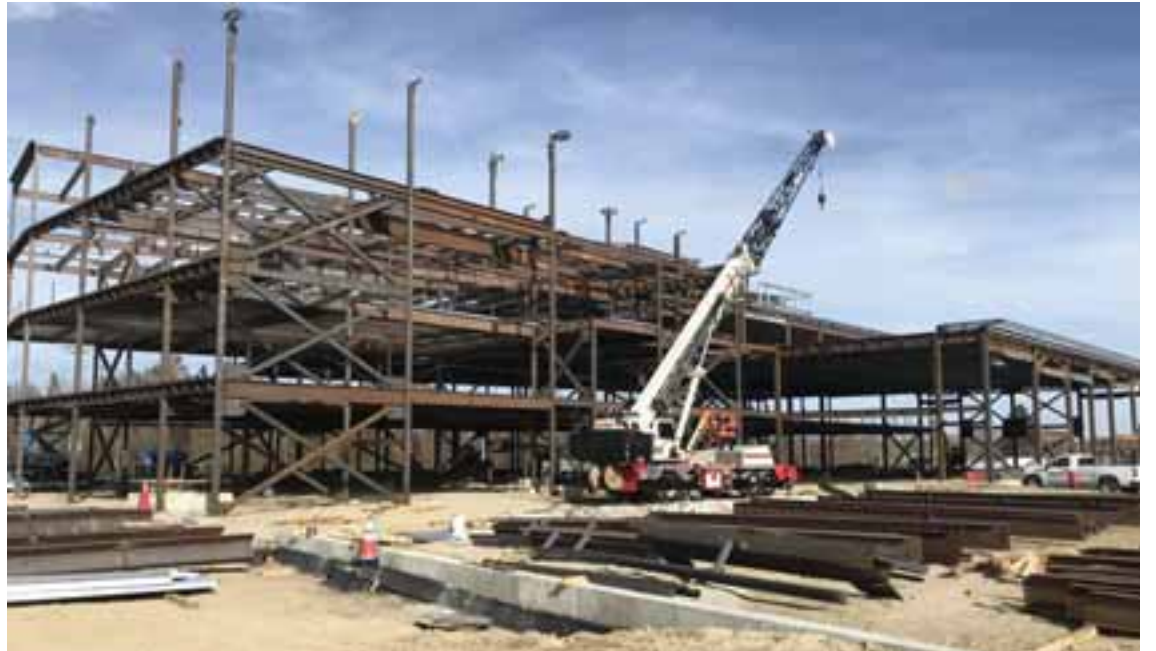
The steel superstructure is going up pretty quickly at the Coakley Middle School in South Norwood.