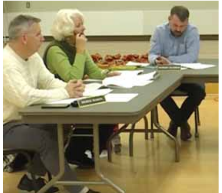
The Planning Board debated the merits of expanding the rezoning effort into Norwood's Downtown.

Holiday Extravaganza Continued on page 7