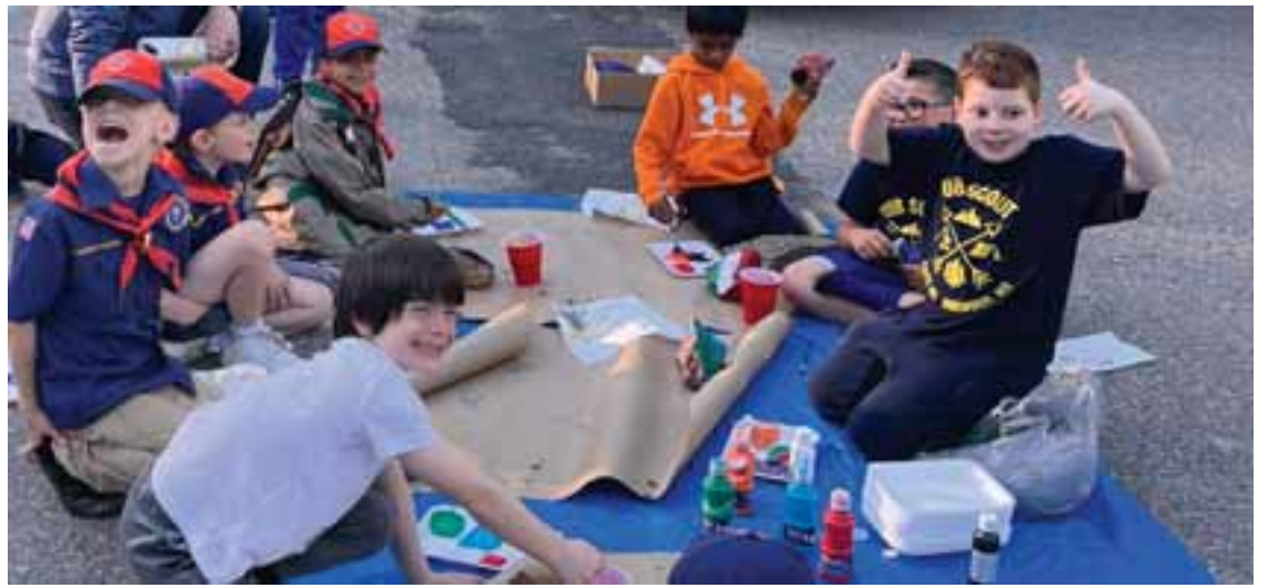
Pack 49 of the Norwood Cub Scouts is gearing up for this year's slate of activities and outings.

"Four years ago our pack was kind of small, and it's funny you know, like it's generational, it was siblings that kept the pack going and all of a sudden we were out of siblings," she said. "So we changed our tactics on recruitment and then, of course,