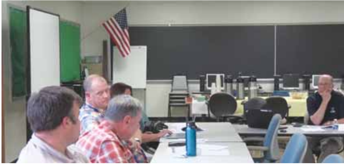
The Norwood Middle School Building Committee confirmed recently no fireworks for Norwood Day on Sept. 9 this year.