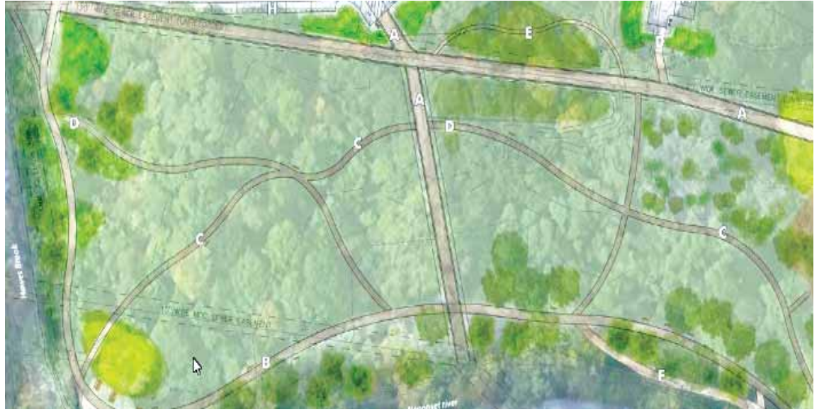
The Planning Board voted to approve the site plan for the Bernie Cooper Memorial Waterfront Park, putting the project over another hurdle before construction starts.

“One on each side of the Neponset along with two boardwalks,” she said. “It will also have all of the amenities that you might expect in a park with benches, picnic