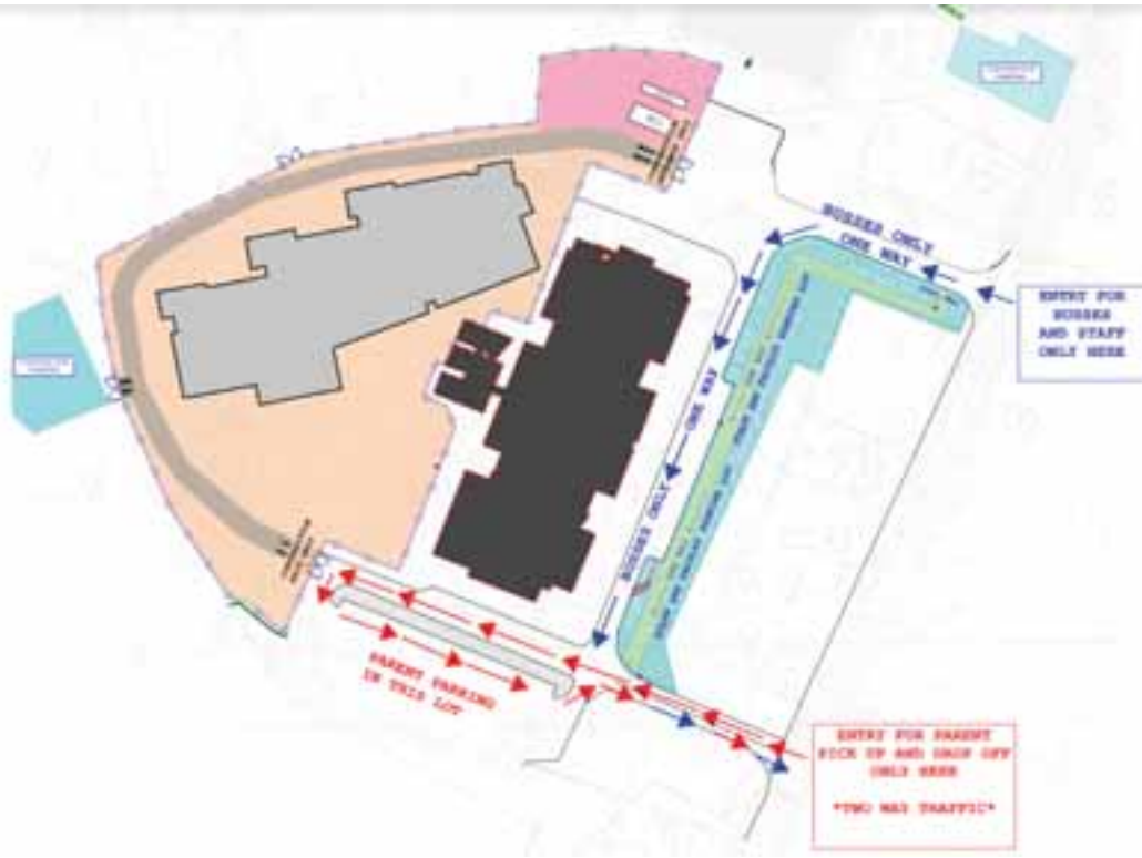
Norwood Public Schools released this new traffic pattern to help ease issues around construction at the Coakley Middle School.