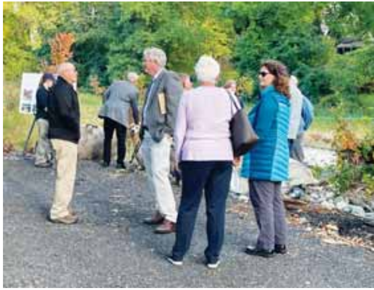
Members of the Norwood Conservation Commission and the Neponset River Watershed Association officially opened Pezwick Park last week.

On a cool and crisp late September evening, Norwood town residents, town officials and Traphole Brook project staff gathered for the official ribbon cutting event for the “new” Pezwick Park on Sumner street in Norwood. The evening marked the culmination of years of planning and work to bring the proposed project to life. On Thursday, September 29th, all those in attendance were able to see the finished project. There were several brief speeches by project and town officials, followed by a tour and explanation of the work that was done.