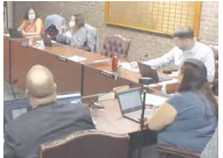
The Norwood School Committee discussed several items, including the need for additional bus drivers.