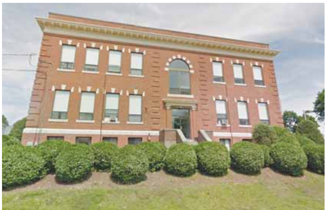
The Norwood Housing Authority administration has said they have been hard at work improving the public housing in Town.