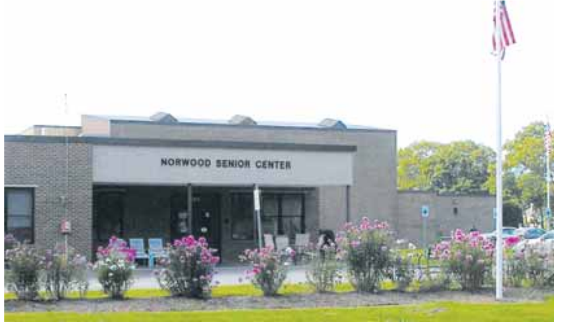
The Norwood Senior Center is recommending residents prepare for the winter this year with heating assistance, which can be obtained if you own your home or rent it.