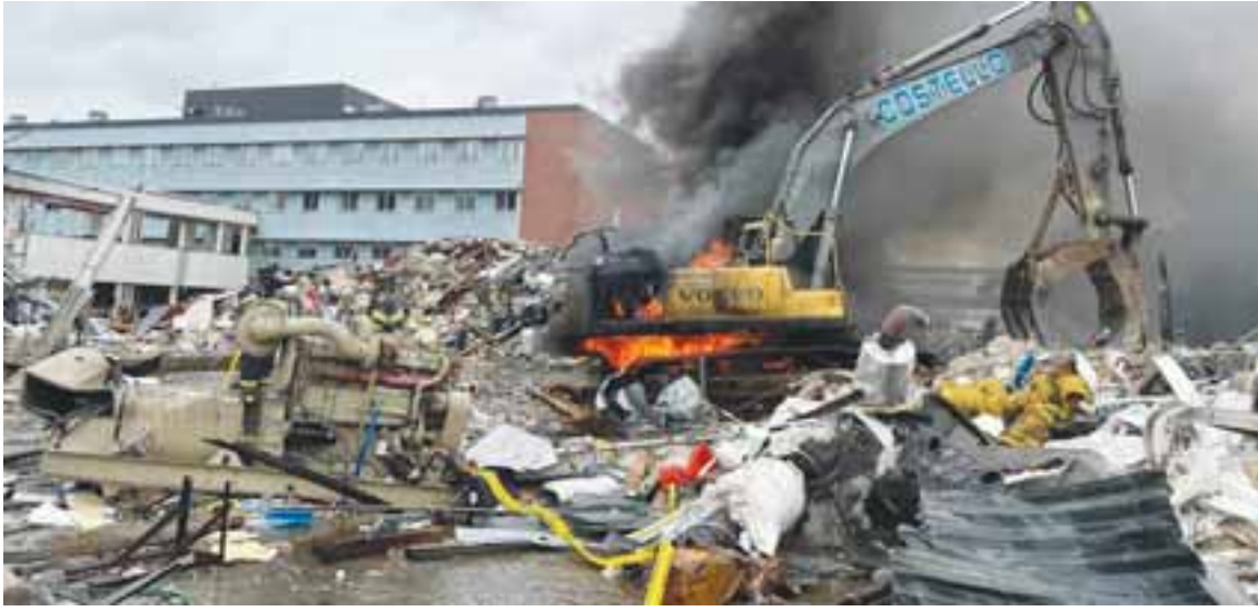
The workers at the Norwood Hospital called the Norwood Fire Department after one of their excavators, shown above, caught fire.