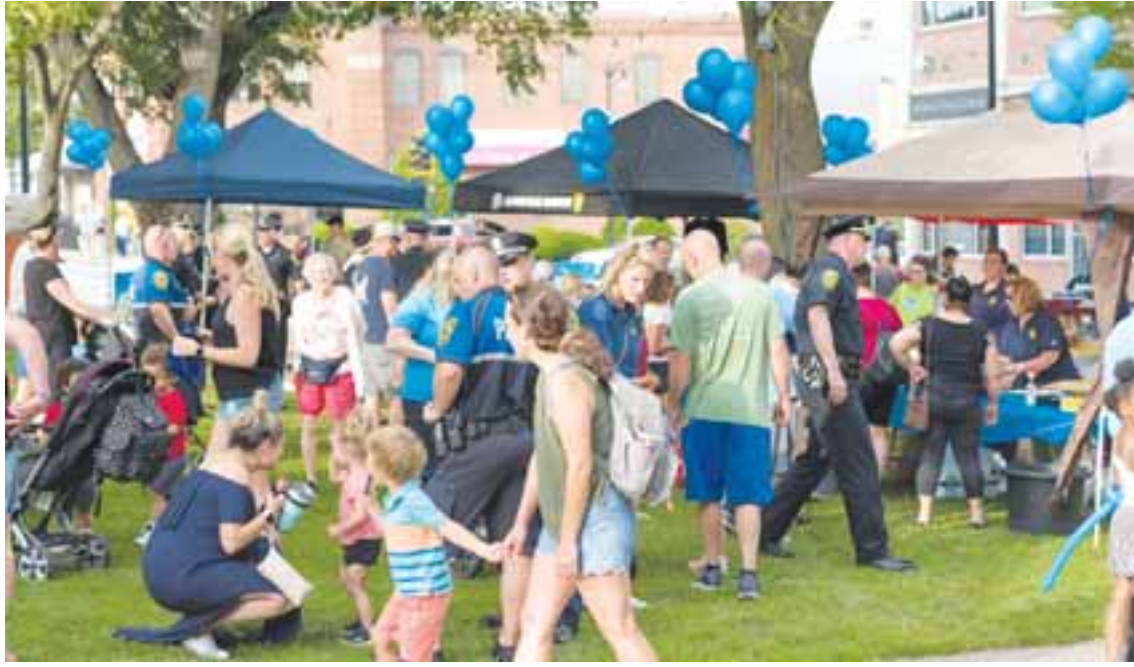
The event is designed to create community between residents and the police.