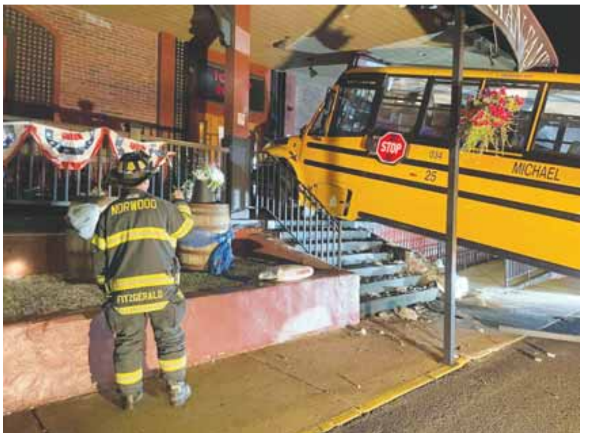
The Norwood Fire Department had a busy week this weekend with a crashed bus and an inflamed excavator at the Norwood Hospital.