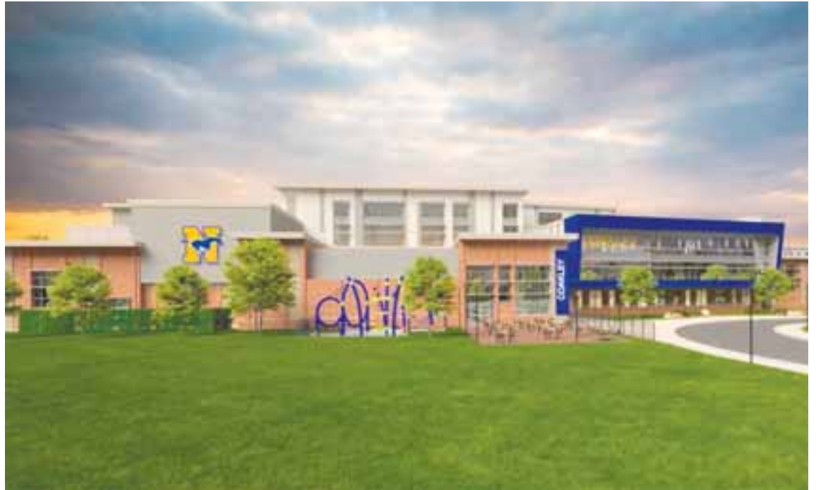
The Middle School Building Committee voted to submit more than $6 million in cost reductions to the project.

Slater emphasized that while some items on the chopping block may not be returned, none