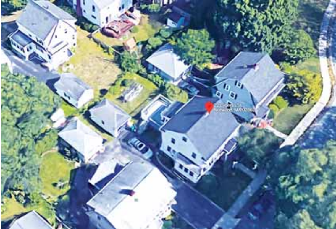
A simple addition became much more complicated at the Norwood Zoning Board of Appeals meeting on Tuesday, as the laws around zoning variances are tough to get around.