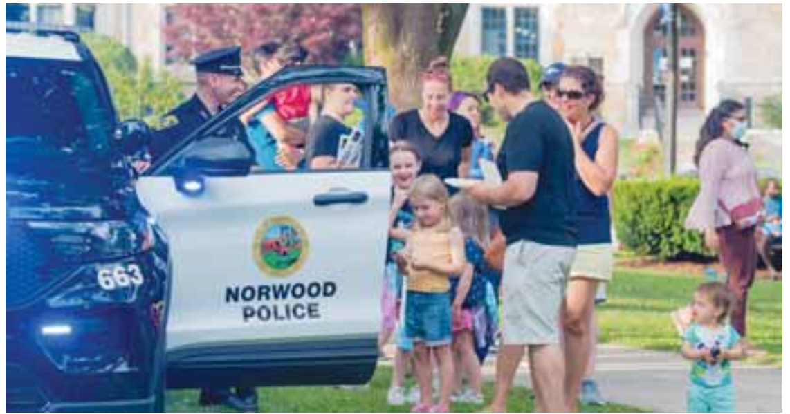
The Norwood Police will be hosting National Night Out again this year at the Norwood Town Common.